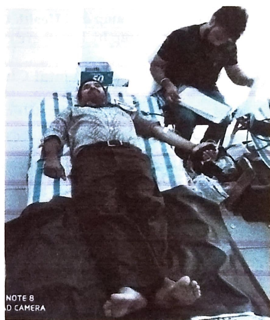
Figure: Blood Donation evident by Students and staff.