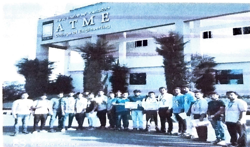
Figure: Picture of the some of the student participants holding certificates