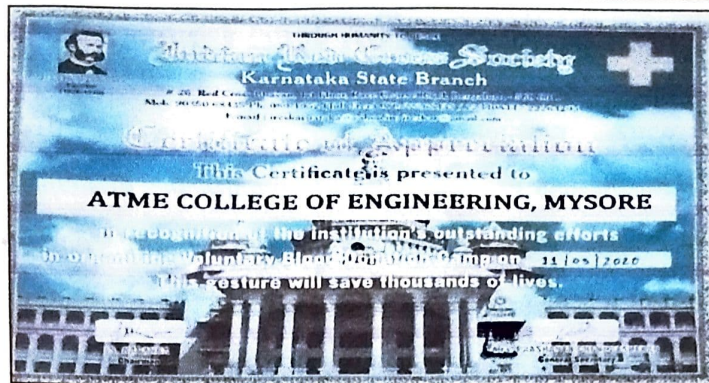
Figure: Appreciation Letter received from Indian Red Cross Society.