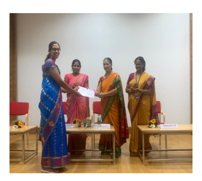
Distribution of certificates to faculty co-ordinators