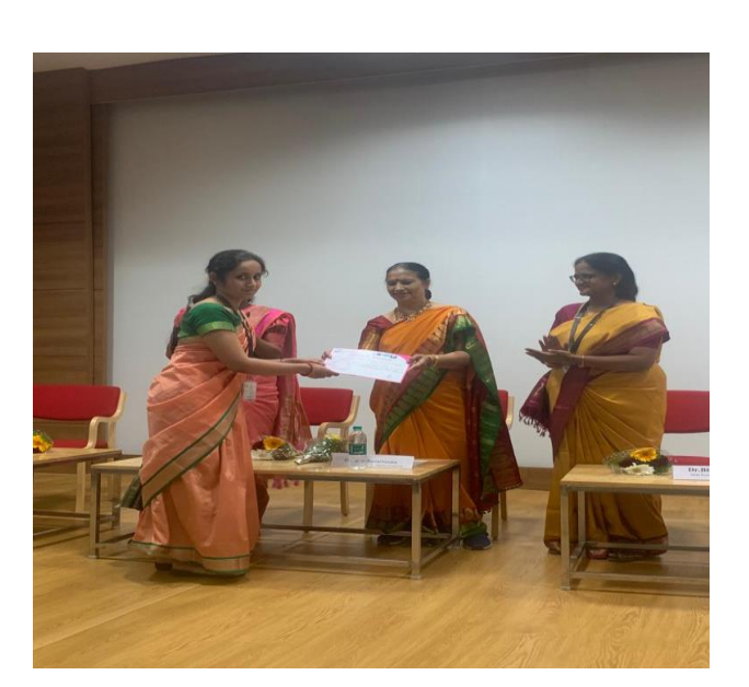
The programme ended with vote of thanks.