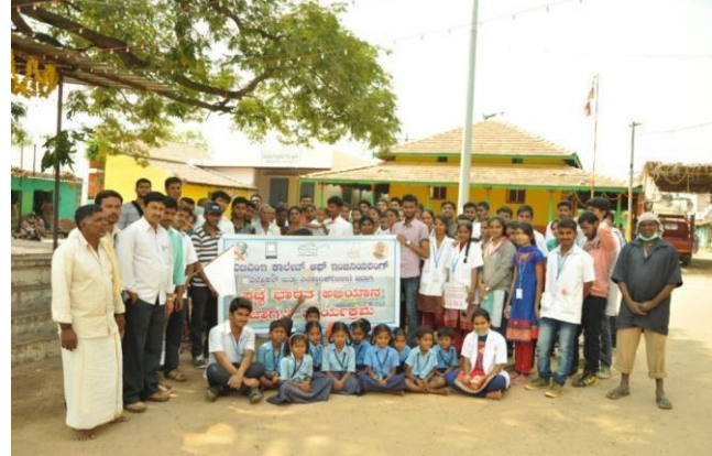
Pic: Staff and Students participated in “Swach Bharat Abhiyaan awareness program” in Mellahalli village, Harohalli post, Varuna Hobli, Mysuru